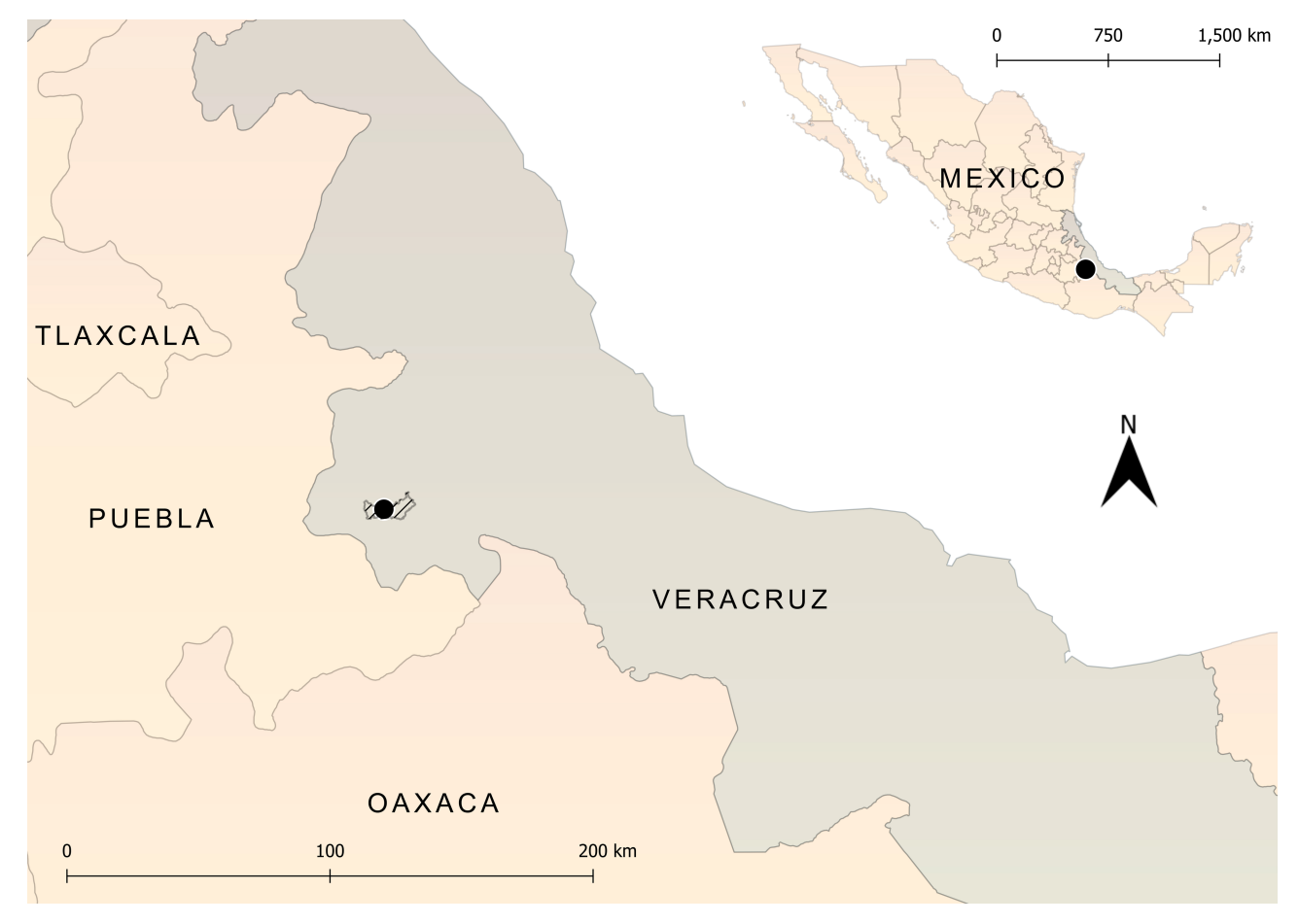
FIGURE 2. Map showing the collection site (black dot) of Anthurium tiswatl sp. nov. in Tequila, Veracruz, Mexico.

Distribution, habitat and phenology: —Anthurium tiswatl is endemic to the municipality of Tequila (Fig. 2), Veracruz, Mexico, in the central region of the state, at 1800–1900 m, in pine-oak forest. It grows in the understory, on the edges of the forest, or in forest fragments. In the vicinity, Anthurium tiswatl may be found in the municipalities of Atlahuilco, Ixtaczoquitlán, Los Reyes, Magdalena, Omealca, Orizaba, San Andrés Tenejapan and Zongolica. All specimens with inflorescences and infructescence were collected in April.