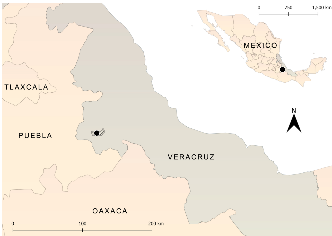
FIGURE 2. Map showing the collection site (black dot) of Anthurium tiswatl sp. nov. in Tequila, Veracruz, Mexico.

Distribution, habitat and phenology: — Anthurium tiswatl is endemic to the municipality of Tequila (Fig. 2), Veracruz, Mexico, in the central region of the state, at 1800–1900 m, in pine-oak forest. It grows in the understory, on the edges of the forest, or in forest fragments. In the vicinity, Anthurium tiswatl may be found in the municipalities of Atlahuilco, Ixtaczoquitlán, Los Reyes, Magdalena, Omealca, Orizaba, San Andrés Tenejapan and Zongolica. All specimens with inflorescences and infructescence were collected in April.